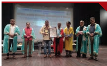
CV Raman Award for Academic Excellence 2021