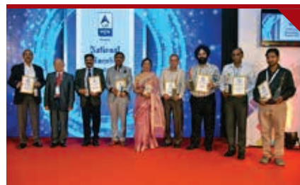
Outstanding Engineering Institute Eastern zone by ABP News in 2016

Awarded " Best performing Institution Innovation Council " for the 4th consecutive year in 2022, by MoE, Govt. of India