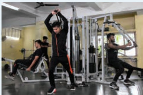
Gym - Well-equipped with a dedicated instructor