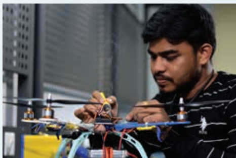
Laboratories with state-of-the-art equipment