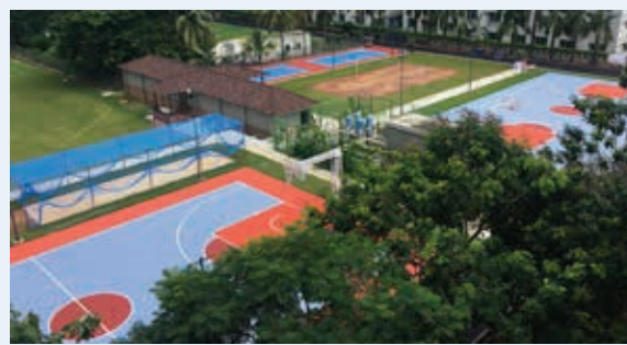
SunDeck – Sports Complex having 400M Running Track, Basketball Court, Badminton Court, Volleyball Court, Football Ground, Cricket Ground.