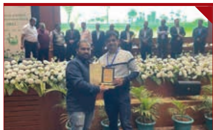
Odisha State Energy Conservation Award 2022