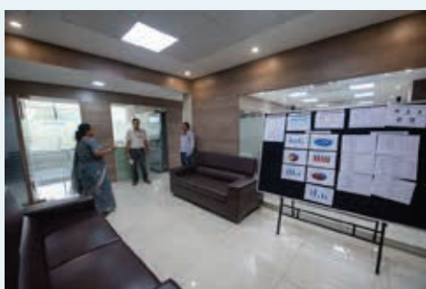
Research Center for building a thriving research community