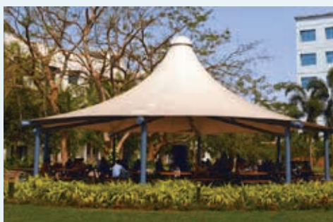
SkyLab - An outdoor 24*7 Wi-Fi zone