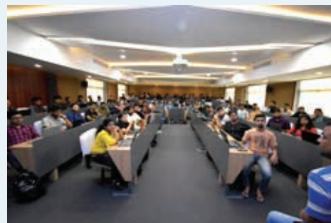
Lecture Theatres with advanced audio-visual setup