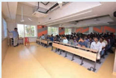
Spacious Classrooms with audio-visual facility