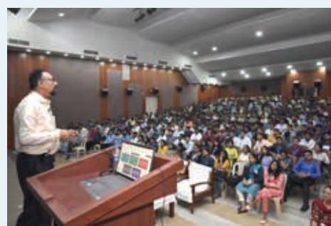
A 400-seater auditorium