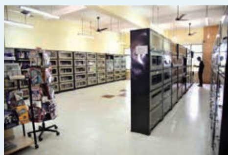
Central Library having discussion rooms & separate reading cubicles